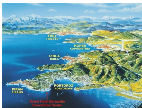
Panorama of the Slovene coast