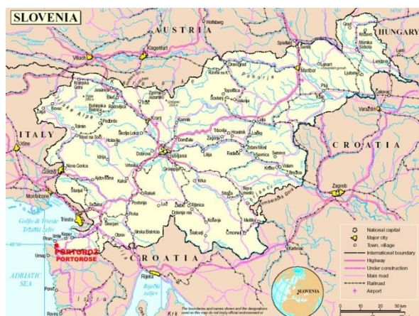
Map of Slovenia